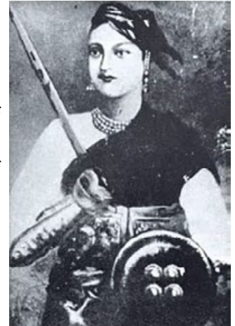
THE RANI OF JHANSI

Lakshmi Bai, the Rani of Jhansi: A lasting symbol of resistance for her leadership in the Indian Rebellion of 1857, Manikarnika (Manu, for short) led a life filled with tragedy but also with some triumph. Manu grew up with her father, who allowed her to learn fencing, horse riding, shooting, and a variety of martial arts in addition to her regular studies, all of which would come in handy on the battlefield later in her life. Before she became the warrior she is known as now, she married the Maharaja of Jhansi and was given the name Lakshmi Bai.