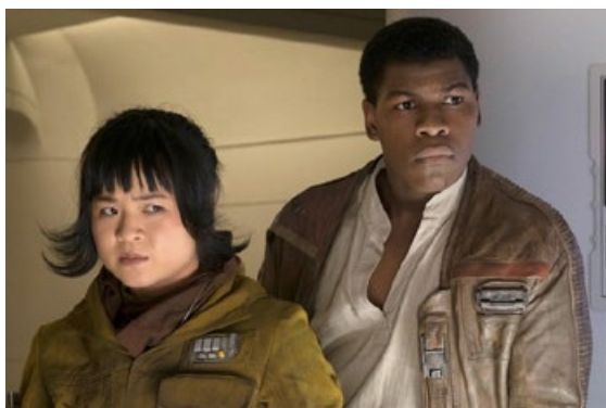
ROSE TICO AND FINN

The prequel trilogy added only a few more characters of color, such as Mace Windu and Captain Panaka, played by Samuel L. Jackson and Hugh Quarshie.