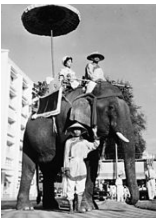
THE TRUNG SISTERS

The Trung Sisters: The Trung sisters, known around the world for leading the first major resistance against the expansion of Chinese rule in Vietnam, continue to be lauded as heroes with an annual festival in their honor. The sisters' rebellion began in earnest in 39 AD, after a Chinese governor executed Trung Trac's husband for protesting increasing tax rates. In response to his death and in continuation of the work she and her husband had started together, Trung Trac and her sister Trung Nhi rallied other women and men to join the fight against the Chinese occupiers. Partly, they fought because women in their culture had different types of freedoms compared to women in China at the time, and they were unwilling to alter their own cultural practices.